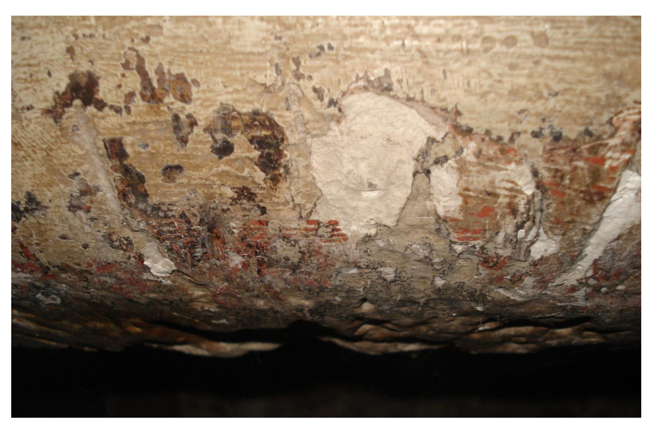
\textbf{Figure 8.} \ \textbf{Tomb monument of Isabel of Aragon, detail of the lower edge of the chest.}