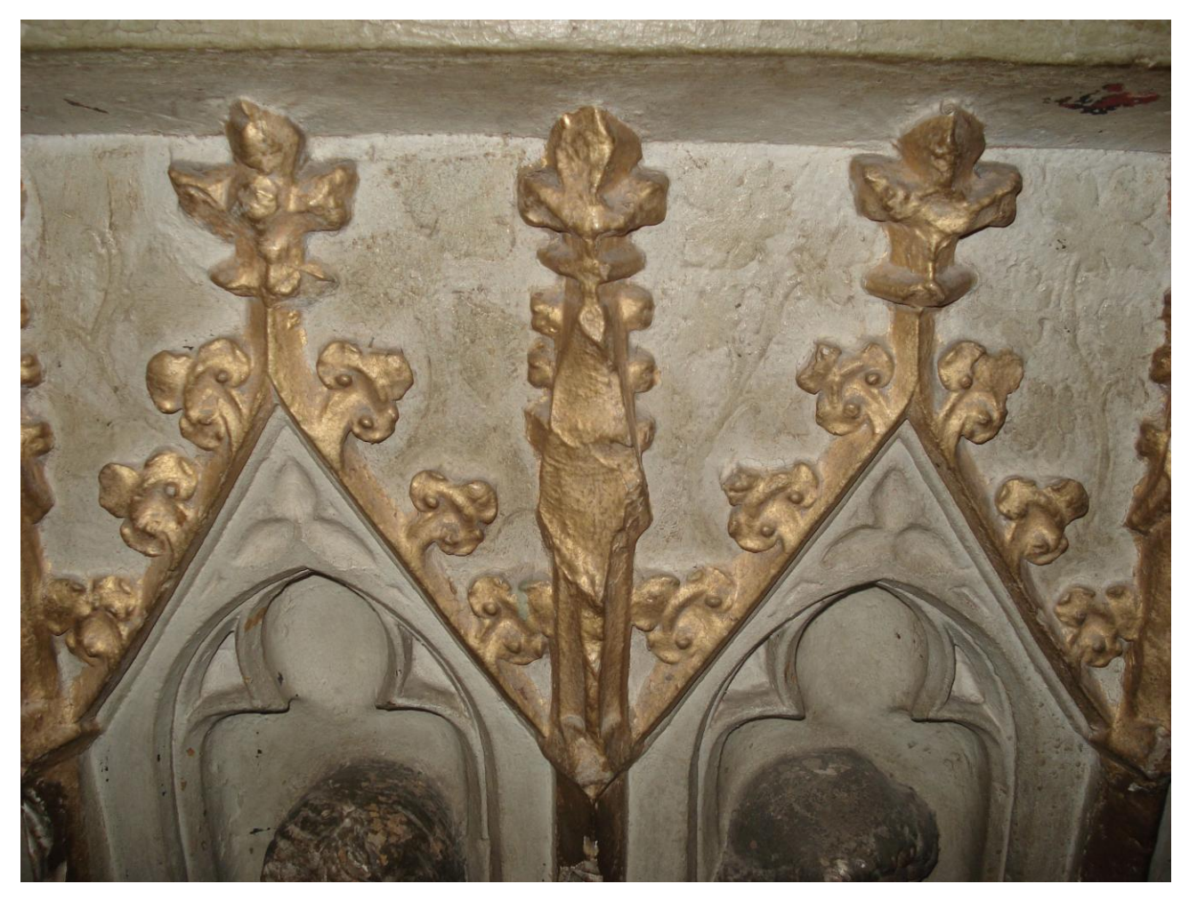
\textbf{Figure 9.} \ \textbf{Tomb monument of Isabel of Aragon, detail of the decoration of the aedicule.