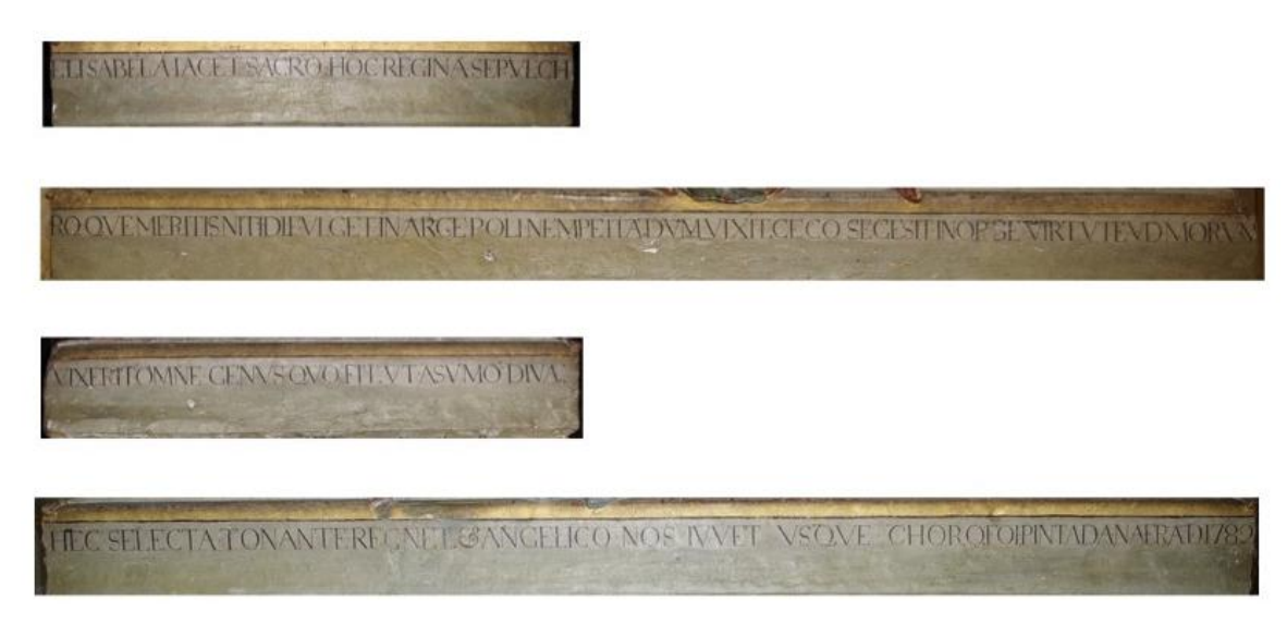
Figure 2. Tomb Monument of Isabel of Aragon, detail of the inscription.

This circumstance supports the hight probability that it was placed on a smooth surface properly prepared to receive it. However, more intriguing is the detailed description of the mausoleum in the report: