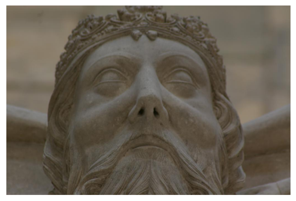
Figure 5. Tomb monument of King Pedro I of Portugal, ca. 1360-67 (Alcobaça, Church of Santa Maria).