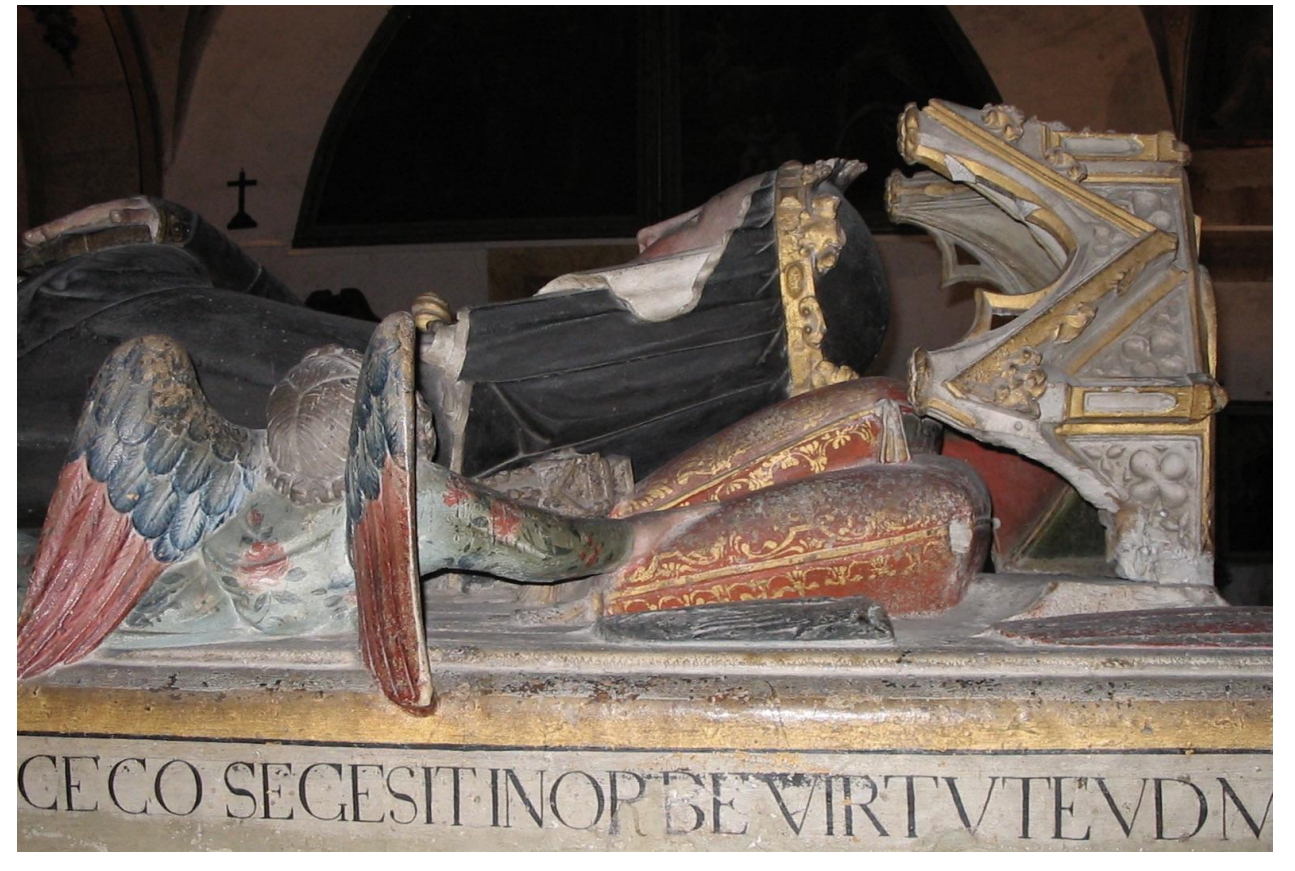
Figure 7. Tomb monument of Isabel of Aragon, detail of the canopy.