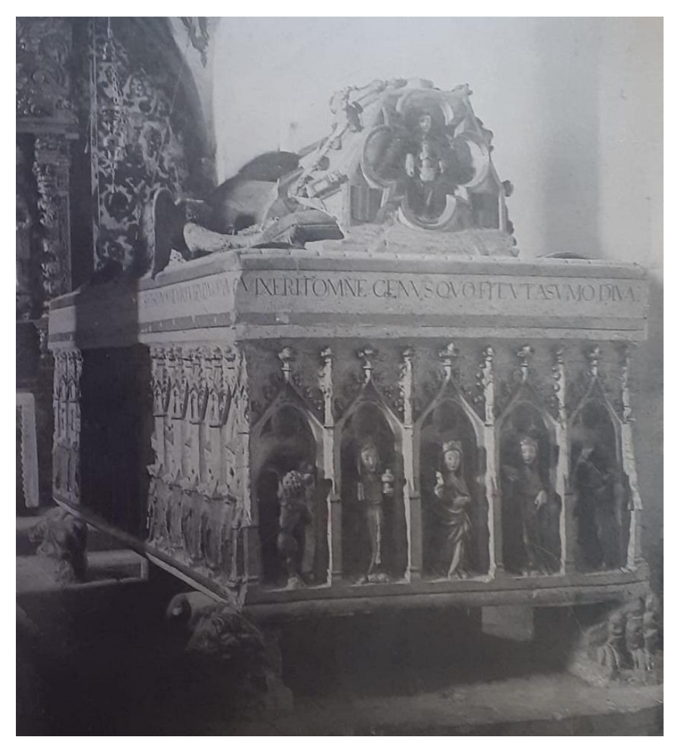
Figure 6. Tomb monument of Isabel of Aragon, Photo-type [7, est. III, p. 57].