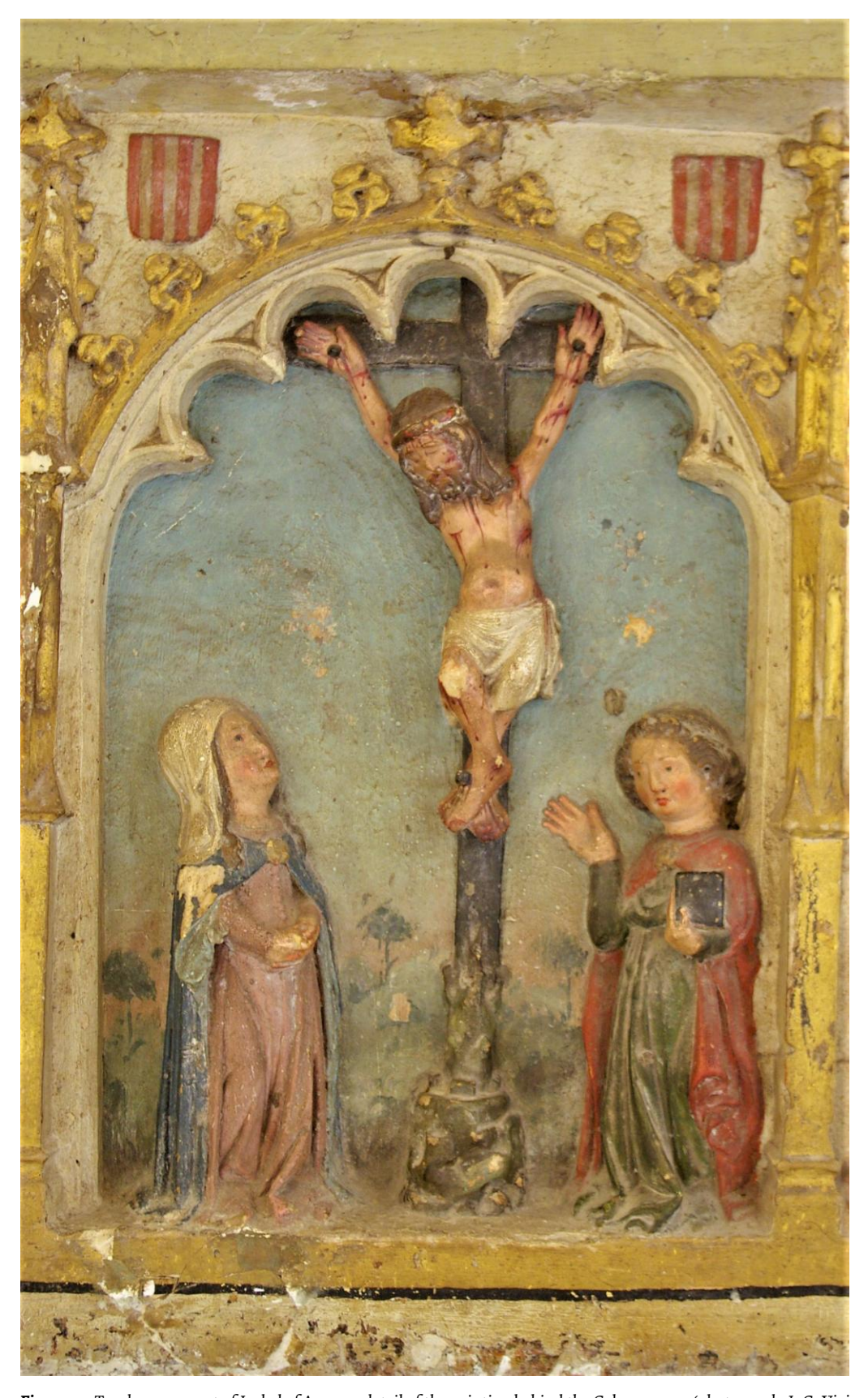
\textbf{Figure 10.} \ \ \text{Tomb monument of Isabel of Aragon, detail of the painting behind the Calvary scene.}

All the interventions – relocation, reworking, repainting and restoration – carried out on Queen Isabel's tomb monument have been reconstructed mostly through written sources, often indirect, or even fleeting mentions, in which, except in the last case, the names of those responsible were missing. However, I have reason to believe that the artists-restorers were