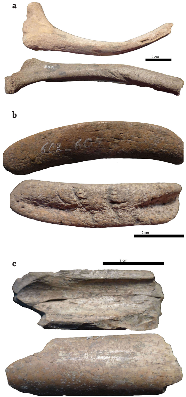
Figure 4. Bones from P2: a) MLP-Ar-(b)580 rib of Pseudolestodon with cut marks; b) MLP-Ar-(b)602-604 rib, polished and with cut marks; c) cortical and medullar faces of MLP-Ar-(b)611.

Then, nine bones were assigned to the “worked bones” category. Different functions, manufacturing ways or species comprise this group. There was a possible tooth of Toxodon MLP-Ar-(b)606-607 that could have been extracted from a bigger tooth. There was also a bevel-cut bone the author described in detail (MLP-Ar-(b)667-668), a polished arrowhead (MLP-Ar-(b)630-631), a polished awl (MLP-Ar-(b)539), a bone that was first longitudinally broken and then stroked in both sides (MLP-Ar-(b)611), a cut and flaked bone to be used for cutting or as a scraper (MLP-Ar-(b)564-566) and two bones that were cut, polished and flaked to be used as cutting implements (MLP-Ar-(b)551-552 and MLP-Ar-(b)554-555). Into this category a possible rib (MLP-Ar-(b)602-604) was also included. It was entirely polished with a group of three oblique cut marks, two of 1 cm and one of 0.5 cm (Figure 4b). With the exception of this last element, up-to date information gave an alternative interpretation to the analysis carried out by Ameghino, as it occurred in the other sites. Four