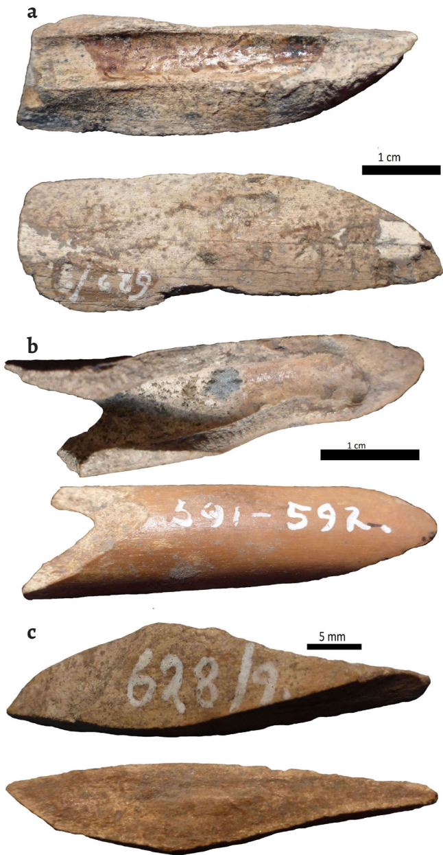
Figure 2. Cortical and medullar faces of bones from P5: a) MLPAr-(b)622/3 with root marks; b) MLP-Ar-(b)591-592; c) MLP-Ar-(b)628/9 flake.

(MLP-Ar-(b)562-563), artificial polish (MLP-Ar-(b)618) and intentional cuttings for producing a pointed edge (MLP-Ar-(b)540-541) were the features sustaining this categorization. Other six bones have been bevel-cut such as the MLP-Ar-(b)583 and the MLP-Ar-(b)585. Bone MLP-Ar-(b)553 also presented concavities and bones MLP-Ar-(b)559-561, MLP-Ar-(b)549-550, MLP-Ar-(b)624-625 had signs of specific strikes in their borders. Finally, bone MLP-Ar-(b)598-600 presented a different style of small strikes on its left side. In this category current interpretations do not match with the alleged functionality of the fragments. Regarding the six bones with an arrowhead (or awl) function, four would have been flakes (MLP-Ar-(b)620, MLP-Ar-(b)621, MLP-Ar-(b)640 and MLP-Ar-(b)562-563). Additionally, bone MLP-Ar-(b)621 had a clear adhering flake (Figure 3b), while the symmetrical strikes of MLP-Ar-(b)562-563 was reinterpreted